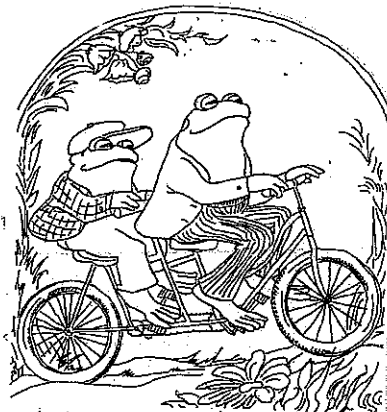
"Frog and Toad All Year"